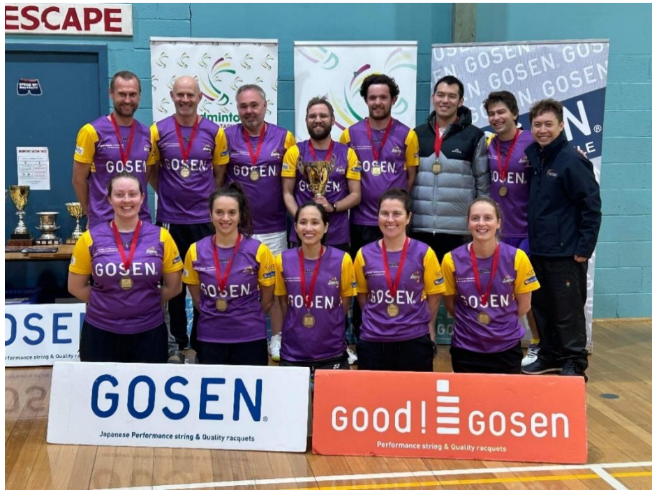
Open Division 2021 GOSEN Tasmanian Teams Champions