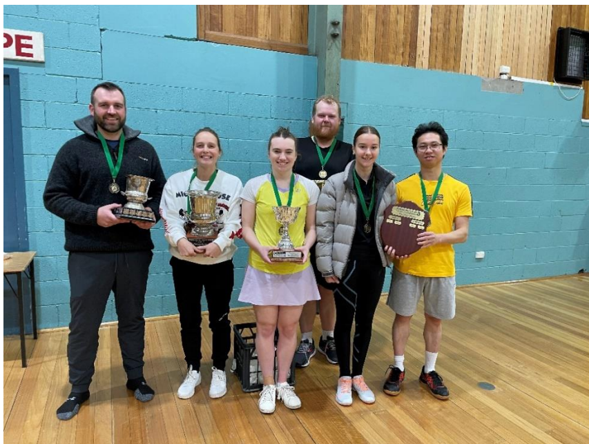
2023 Bellchambers Cup Winners