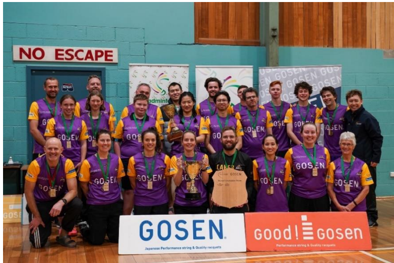
2023 GOSEN Tasmanian Teams Championships – Overall Teams Champions